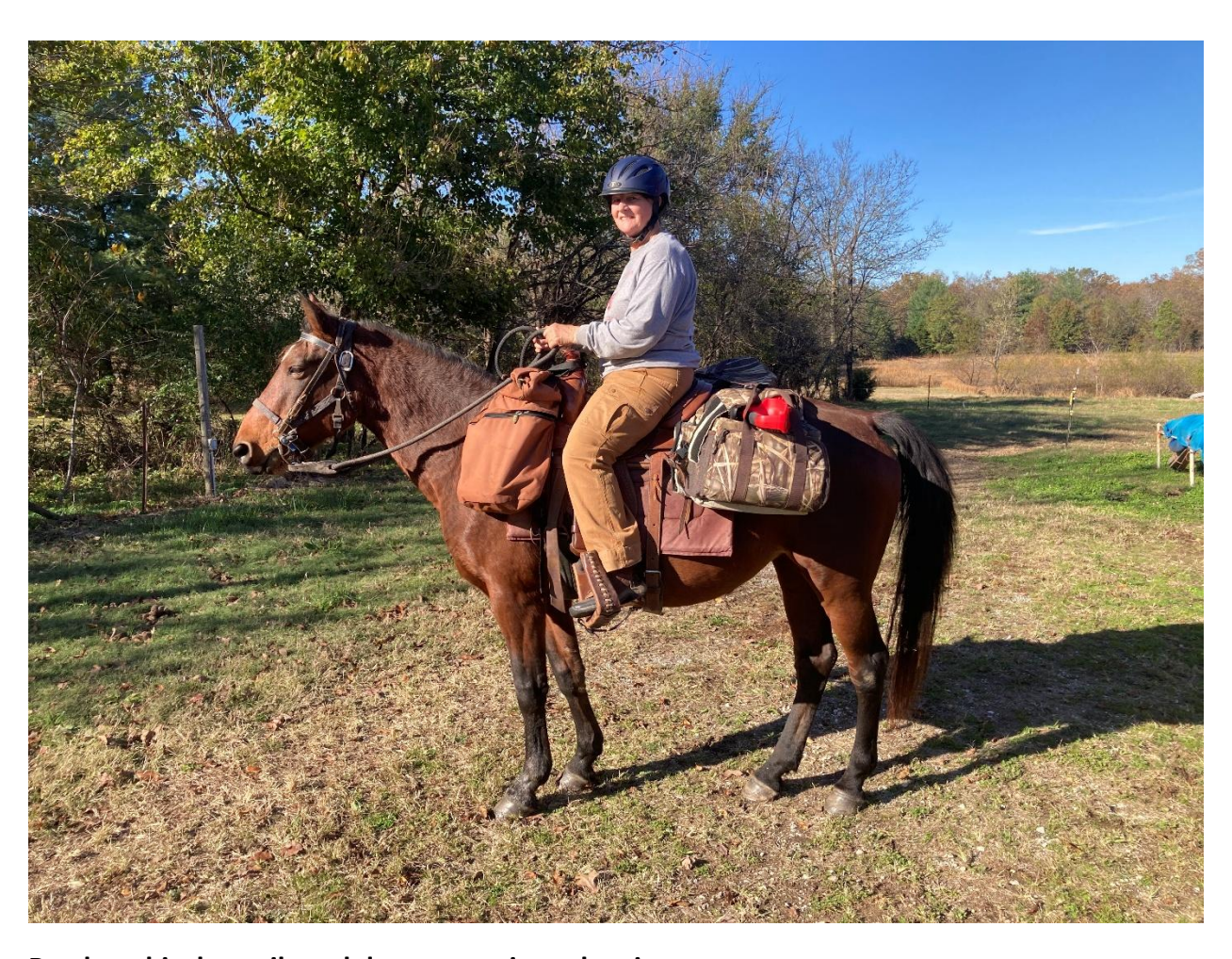
Ready to hit the trails and do some serious cleaning.