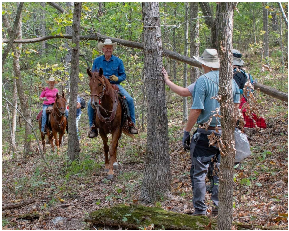
Cooperative effort between partner groups.