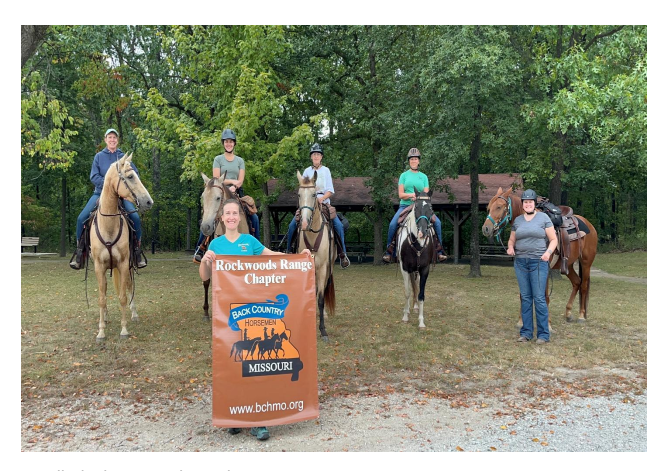
Proudly displaying our chapter banner.