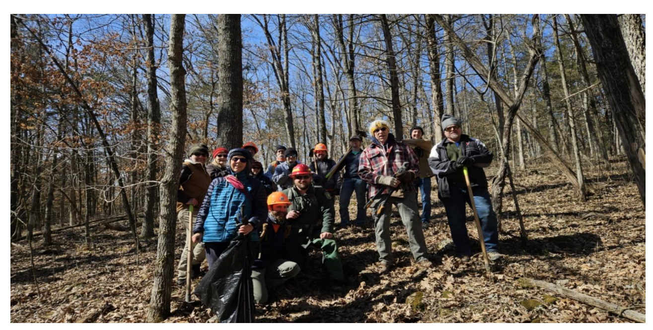
Trail skill day in Mark Twain National Forest Dry Fork Recreation area with USFS, COMOTA, and Heartland Chapter BCHMO

In 2024 Heartland built mounting block inside Dry Fork Recreation area campground and began working with COMO Trail Association on some reroute projects on the Smith Creek section of Mark Twain National Forest as part of the COMO Trail Association Great American Outdoors Act funded project. Heartland worked with the USFS Recreation Specialist in 2024 outlined needs and partnership on moving the Moon Loop TH in Mark Twain National Forest off Ginn lane and creating new TH across from Paris Fork Church in order to ease parking pressure in the church parking lot. Preliminary discussion with USFS resulted in plan for USFS inOhouse projects for the two Trail Heads. Several members of COMO Trail Association and the USFS joined the Heartland Annual dinner and meeting in January to coordinate efforts of USFS, COMOTA, and Heartland on the Trail Head projects and the COMOTA GAOA funded project.