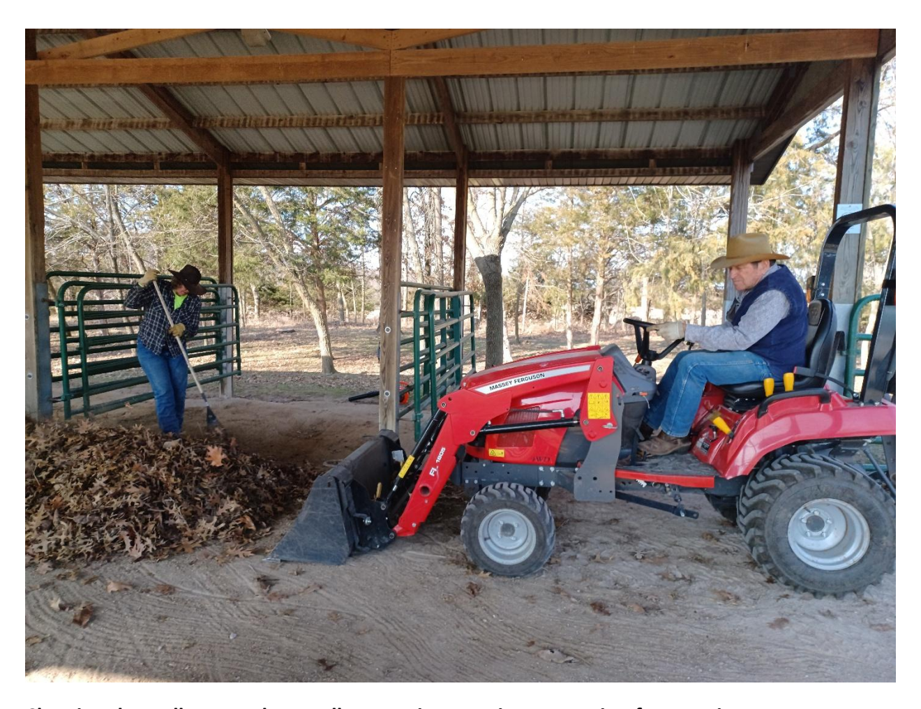
Cleaning the stalls at Frank Russell Recreation area in preparation for camping season.