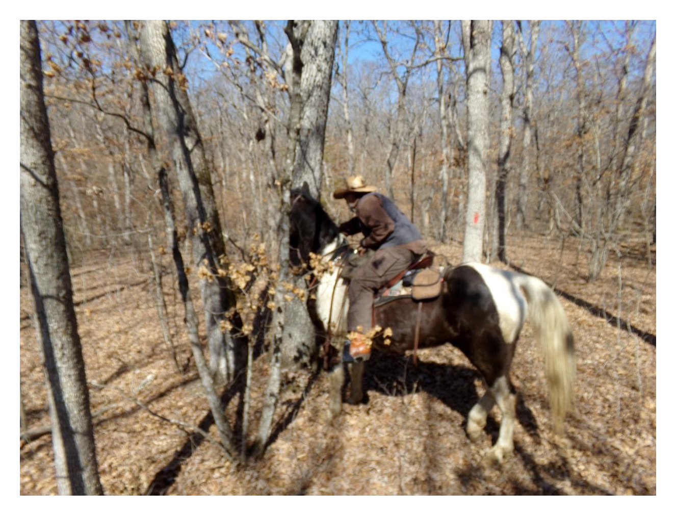
Clipping and lopping are never ending parts of trail maintenance.