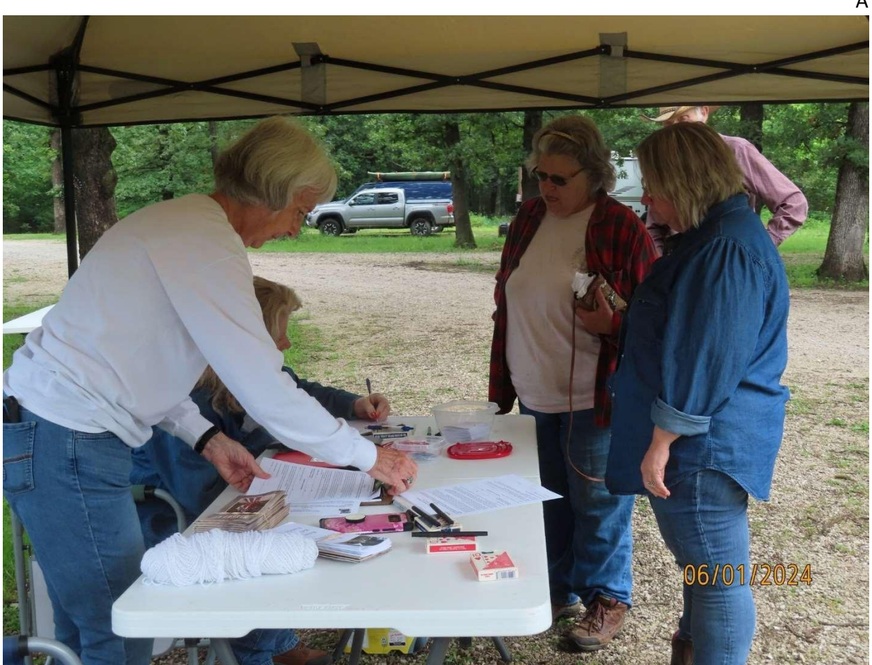
Annual Pace Race