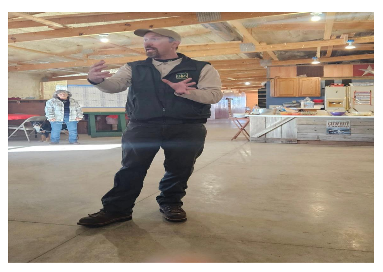
USFS Staff at Heartland annual meeting and dinner