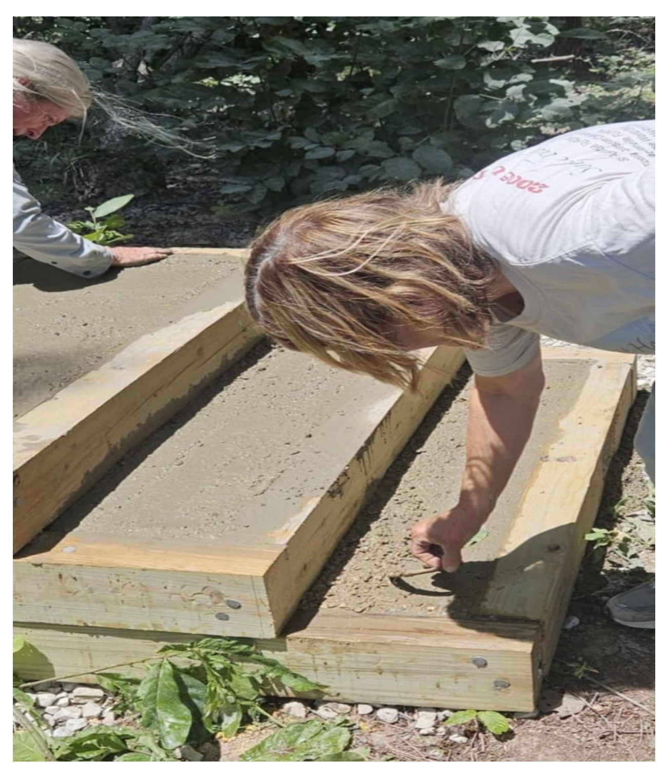
Mounting Block Dry Fork USFS Trail Head