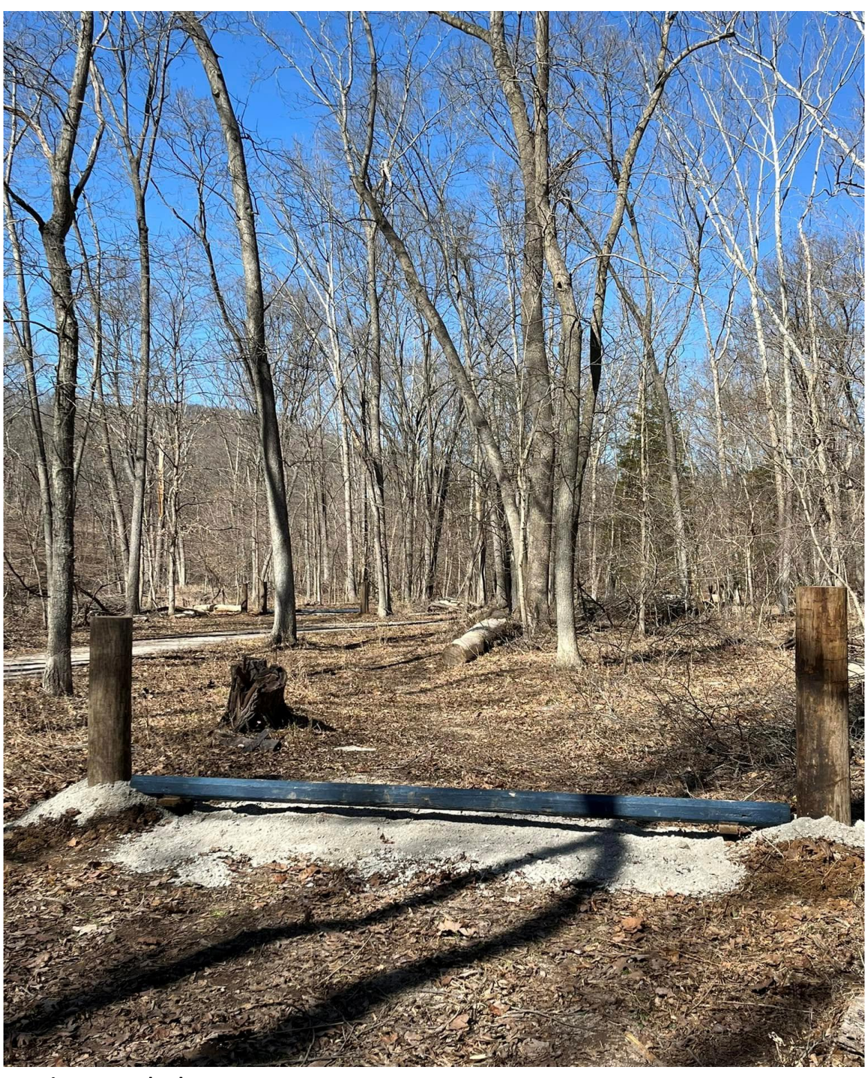
New jump standards.