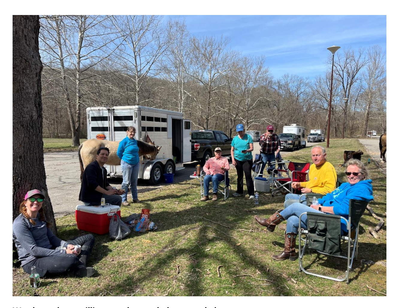
We always have willing members to help on work days.