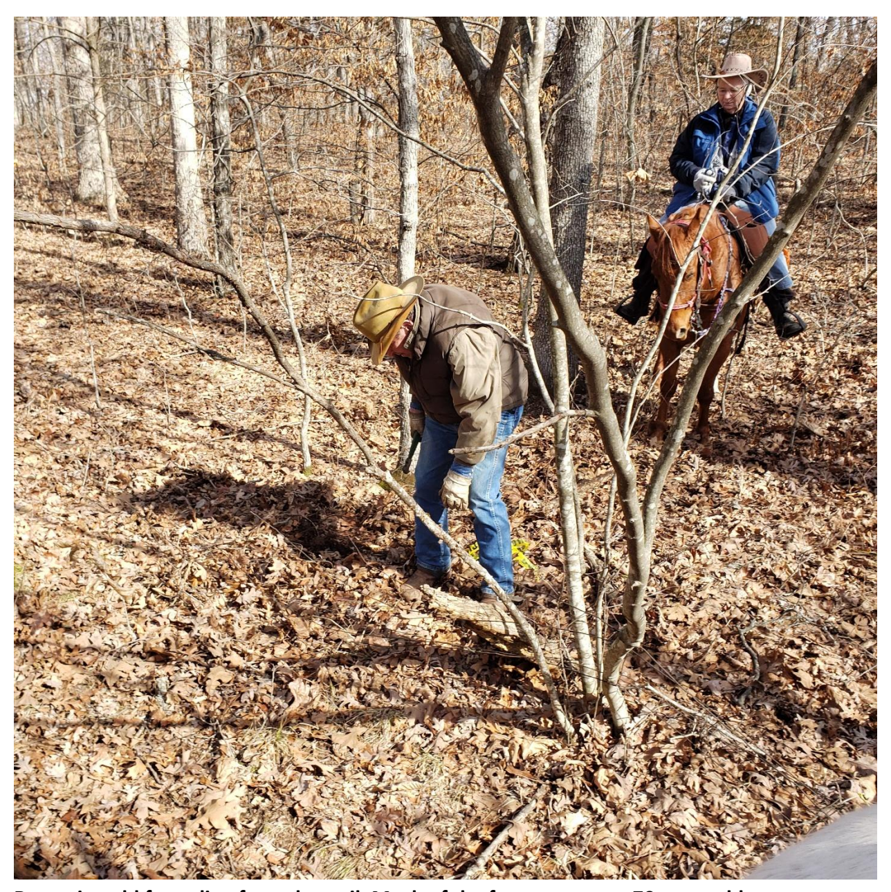
Removing old fence line from the trail. Much of the fences are over 70 years old.