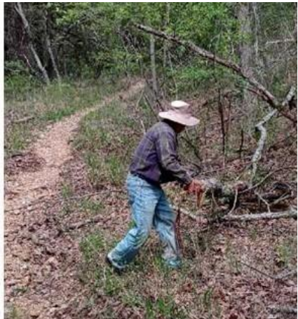
Handsaw and Clear Small Tree on the Trail