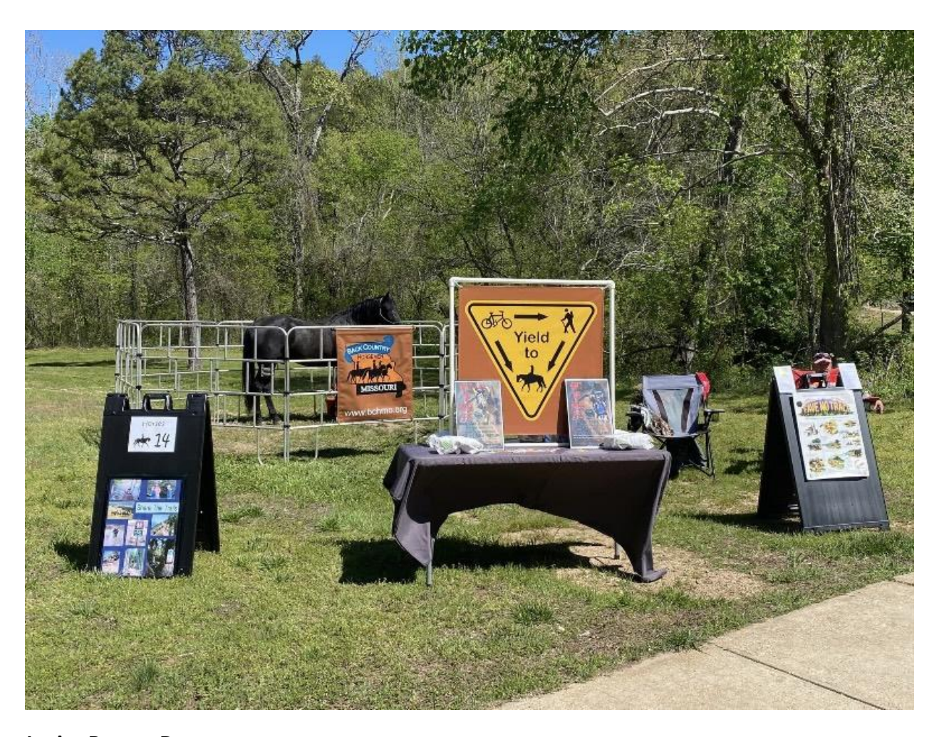
Junior Ranger Day setup.