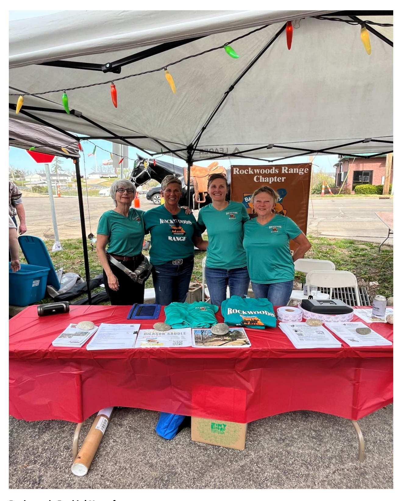
Rockwoods Rockin' Horsefest