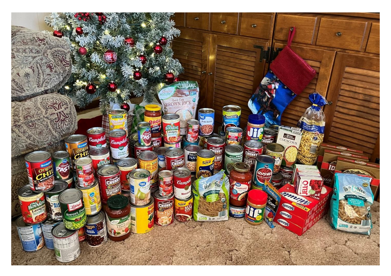
Our annual food drive helps the less fortunate members of our community.