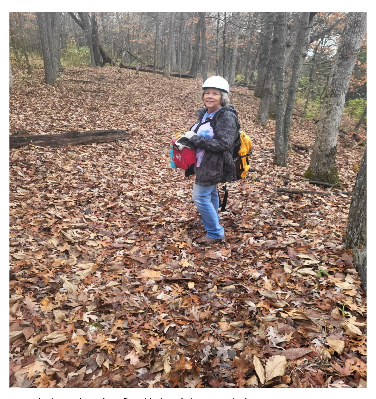
Remembering to always have first aid when chainsaws are in the area.