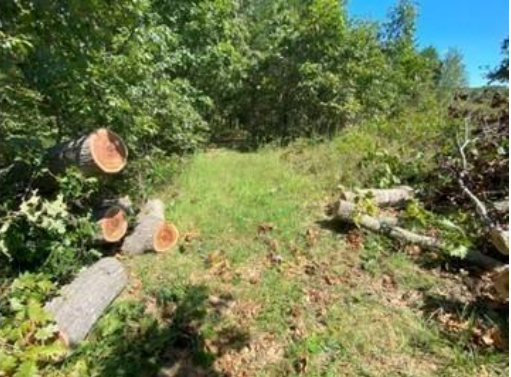
Chainsaw and Clear large Tree on the Trail