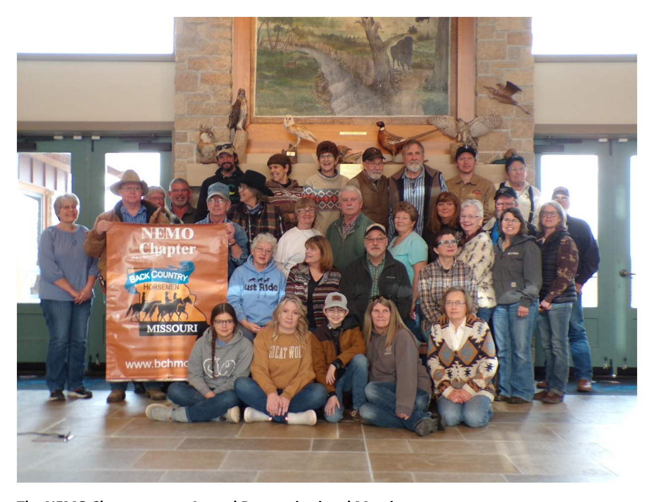
The NEMO Chapter at our Annual Reorganizational Meeting.