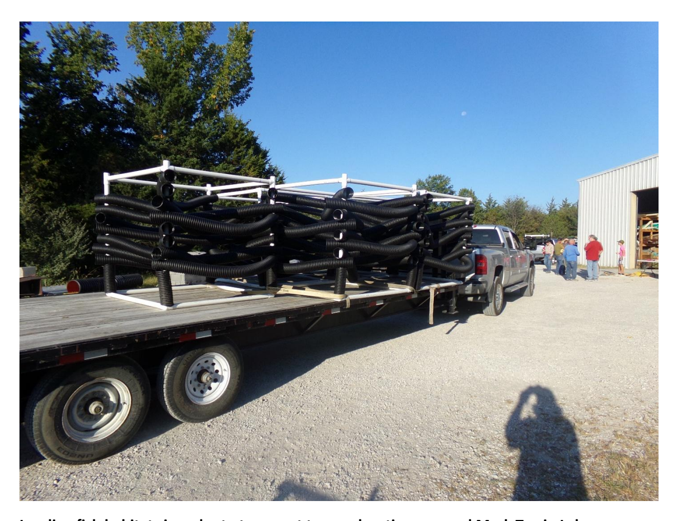
Loading fish habitats in order to transport to area locations around Mark Twain Lake.