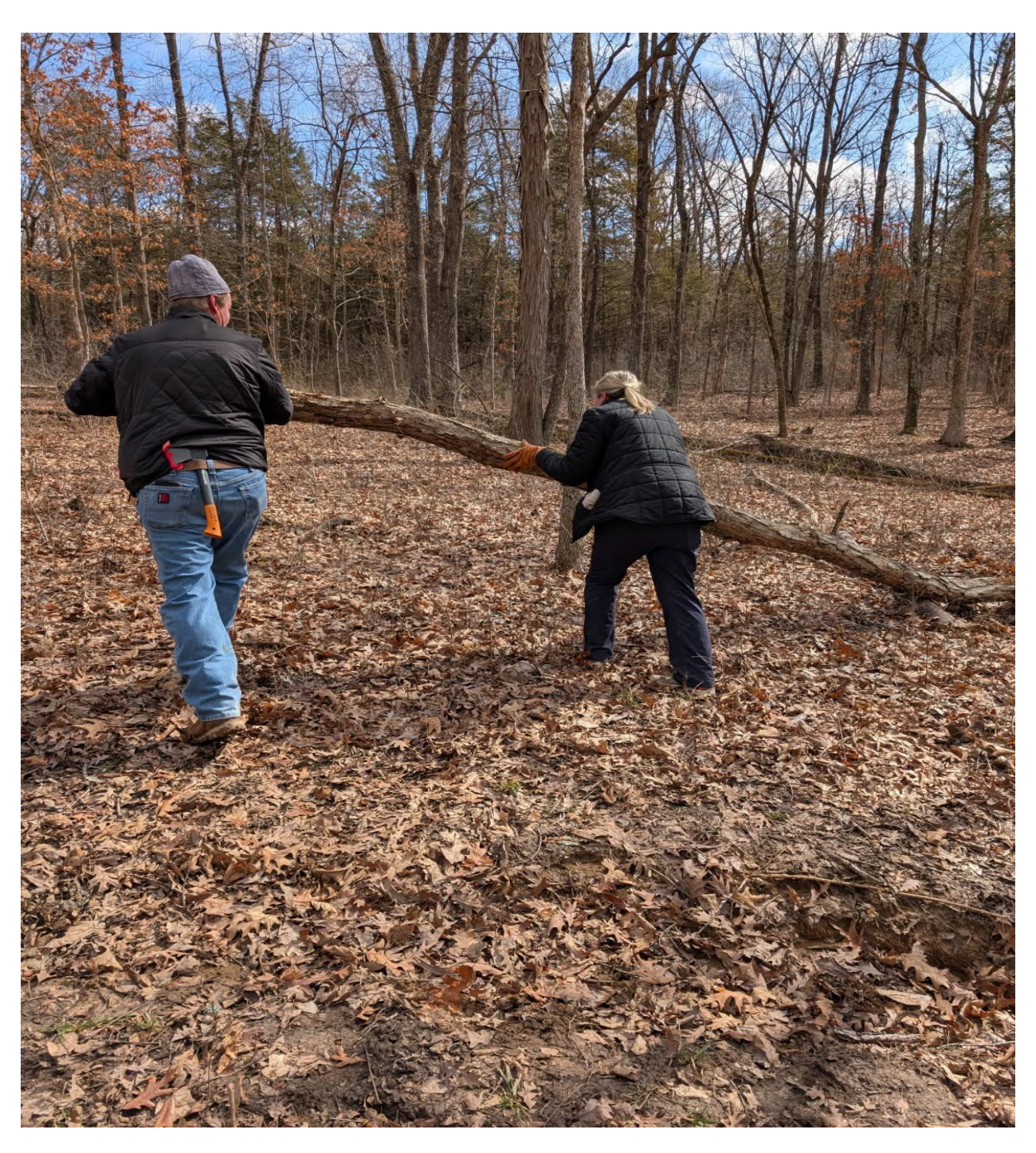
It takes teamwork.