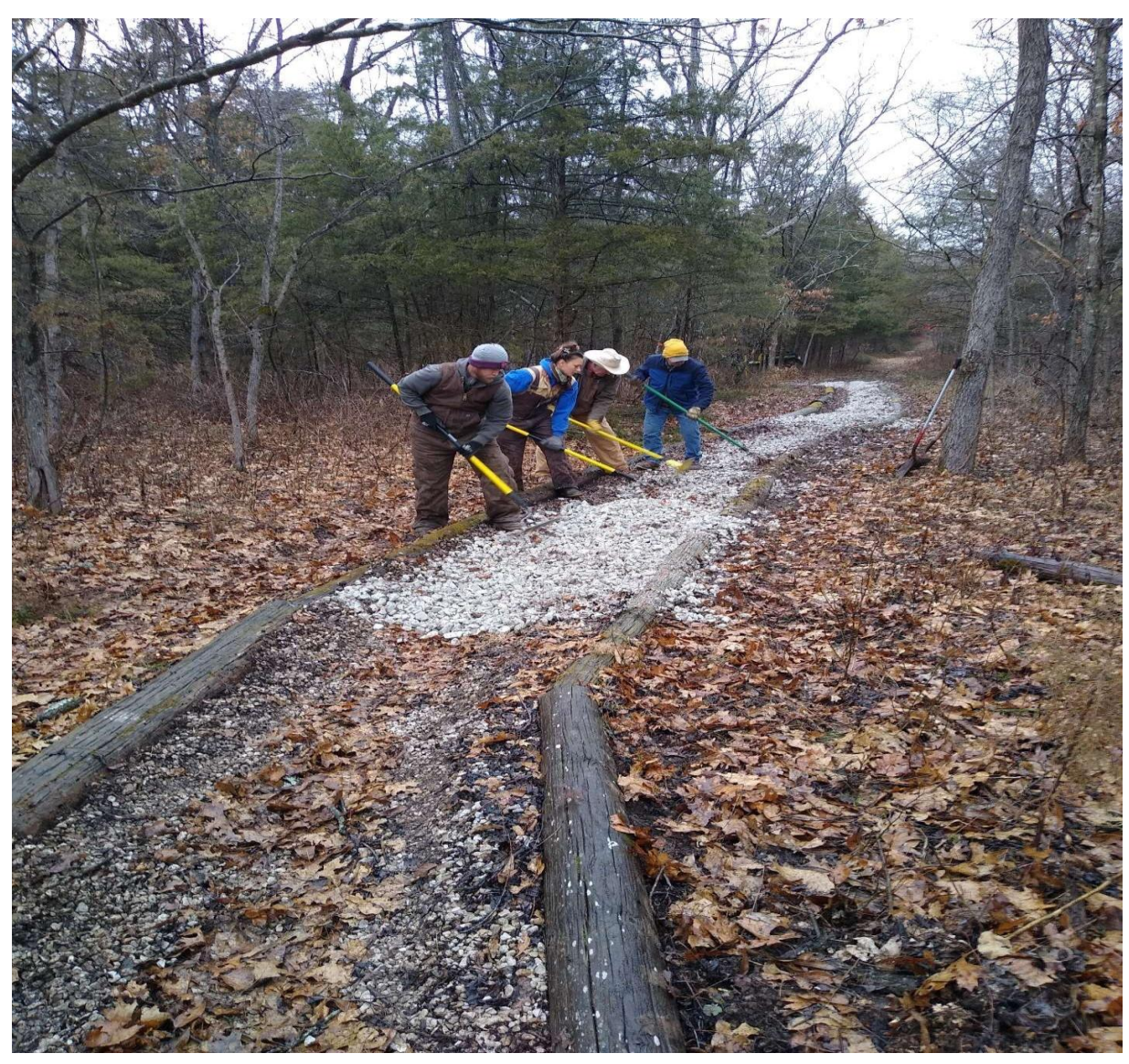
Placing gravel along the tread of the trail.